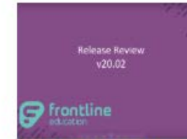
Full Release Review (58 minutes) Finance Release Review (25 minutes) HR/Payroll Release Review (32 minutes)