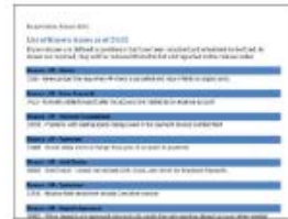
Known Issues PDF Format