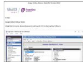
Release Notes PDF Format

Summary: 80 Change Requests, 23 New/Updated Report Change Requests.