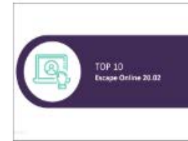
Top 10 (11 minutes)